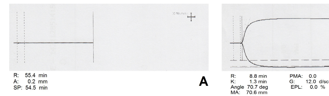
Fig. 1. Thromboelastogram at presentation (A) and after administration of 2000 U prothrombin complex (B).A: severe clotting impairment due to anticoagulation overdose (flat line); B: near normal clotting activity (partial reversal of anticoagulation)