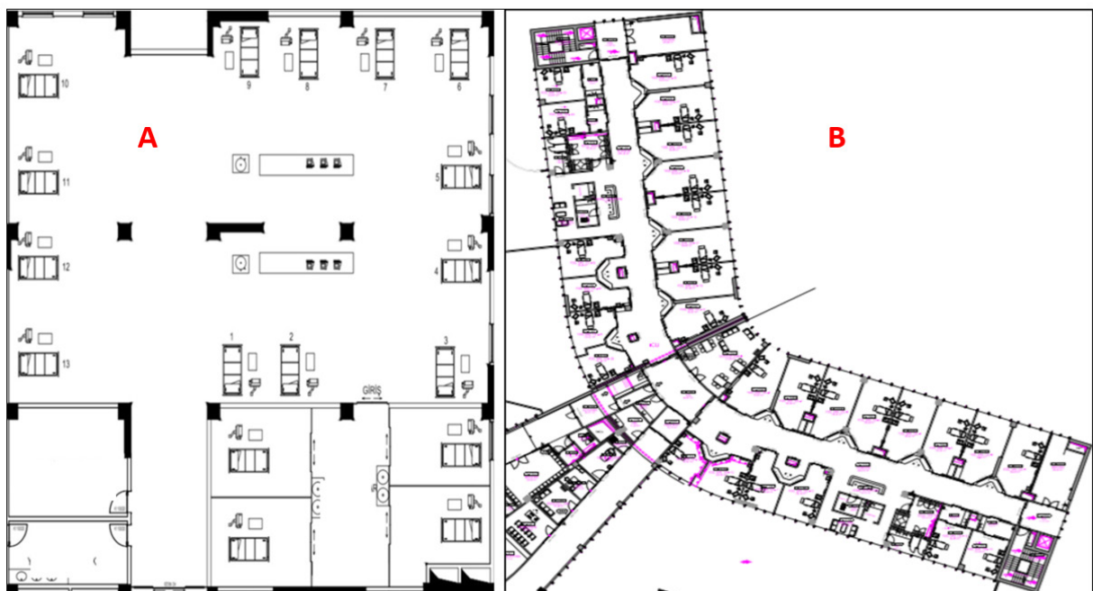
Supplementary figure 1: Intensive Care Unit Plans in the Old Hospital (A) and The New hospital (B). OldH: Total working area is 516 m 2 . NewH: Total working area is 1600 m 2 .

Each nurse was assigned to provide dedicated care for two or three patients in each shift.