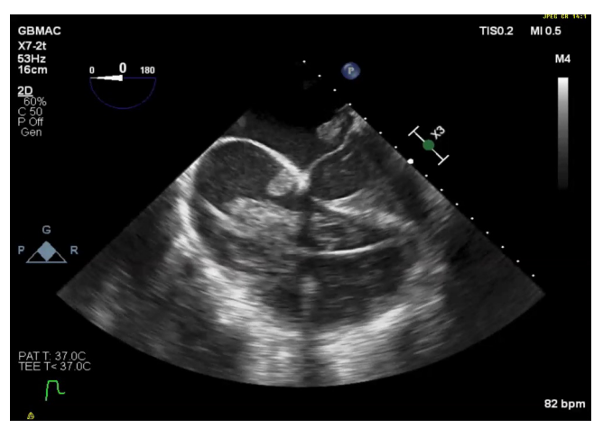
Fig. 1. Clots located in all four chambers