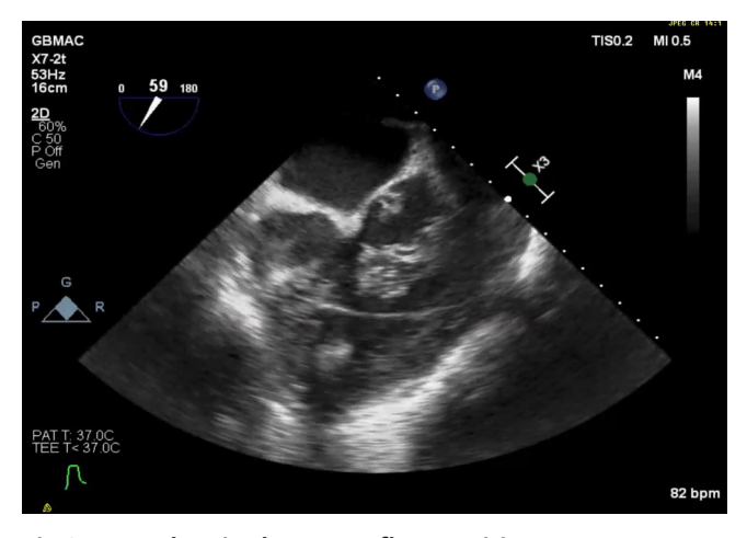
Fig.3 Large clots in the RV outflow position

tive circulation, the transplant surgery was aborted. After consulting again with the interventional radiology team, carrying out the removal of clots was now considered futile, and the decision has been made to transfer the patient to the critical care unit. The patient expired within one hour, despite continuous CPR and vasoactive agents' infusions.