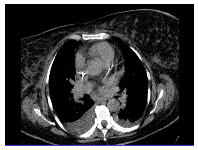
Fig. 3. The CT scan of the chest (multiple foci of opacity disseminated in both lung fields, bilateral pleural effusion)

The possibility of multiple organ failure and the occurrence of disseminated intravascular coagulation was taken into account. The patient required inotropic support. Orotracheal intubation and mechanical ven-