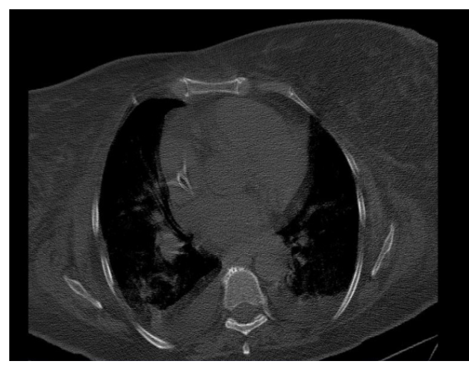
Fig 4. The CT scan of the chest (multiple foci of opacity disseminated in both lung fields)