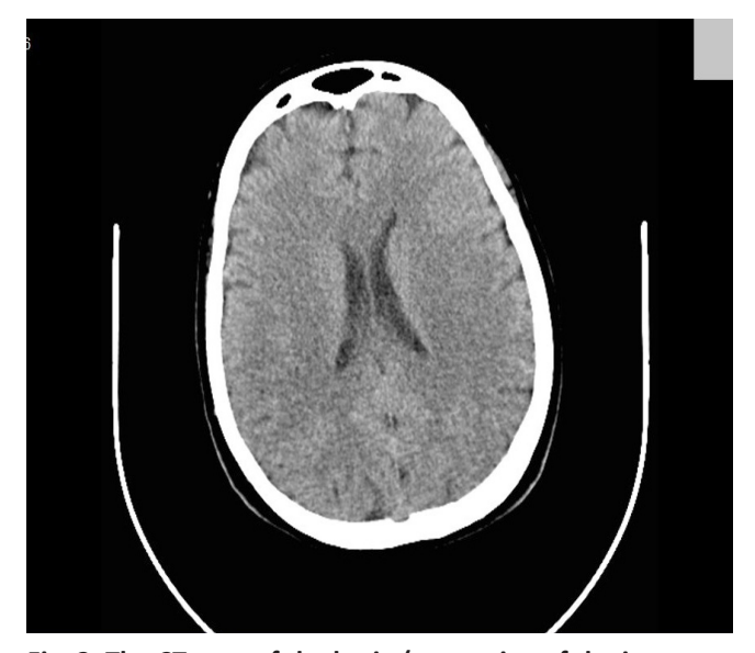
Fig. 2. The CT scan of the brain (narrowing of the intergyral fronto-occipital bilateral sulci)