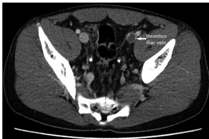
Fig1. CT scan - thrombus in the left common iliac vein (white arrow)

The incidence of Serratia marcescens , an opportunistic organism, is high among immunocompromised and debilitated hosts (7). Our patient is considered to be a debilitated host due to the recent appendectomy and prolonged hospitalization, firstly due to the surgical intervention and afterwards to the DVT episode. Mortality related to Serratia marcescens bacteremia is reported to be between 10-20% (21,22). A wide range of incidence values for bacteremia in pediatric patients